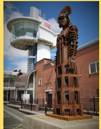
'Sentius Tectonicus' at Segedunum Roman Fort and Museum

https://www.robertwyattconstructionkit.com